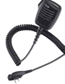
HM-159LA Full size durable speaker-microphone