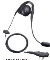
HS-94LWP Earhook headset with boom microphone for hands-free operation