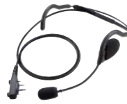
HS-95LWP Behind-the-head type with boom microphone for hands-free operation