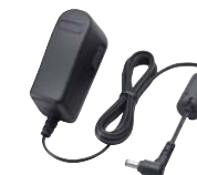
AC adapter BC-123SE/SUK*