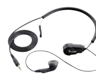
HS-97 + VS-4LA or OPC-2004LA* Throat microphone with earphone

* Either VS-4LA or OPC-2004LA is required when using HS-97 headset. VS-4LA: PTT switch cable for manual PTT operation OPC-2004LA: Plug adapter cable for VOX hands-free operation HS-94 and HS-95 also can be used with either VS-4LA or OPC-2004LA.