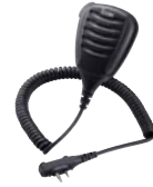
HM-168LWP IP67 waterproof speaker-microphone