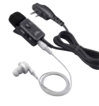
HM-153LA Lapel type microphone with earphone