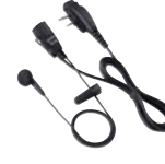
HM-166LA Light weight earphone microphone